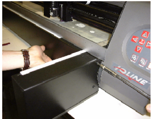
Fig. 2 - Place a ruler on the white strips while tightening the mounting screws.